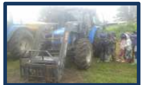
I liked the tractor because we got to go inside it.